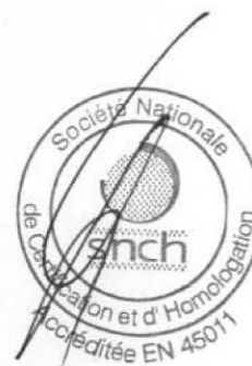
Gilles AST Expert technique